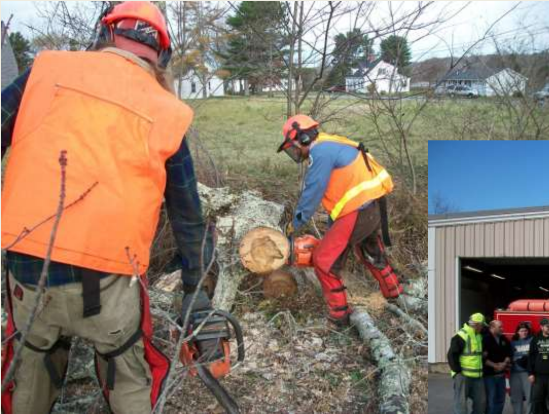
MCC Crew working debris- Storm cleanup Nov 2014