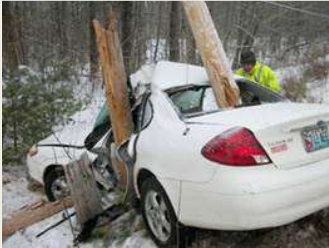
Vehicle Accident, 2012