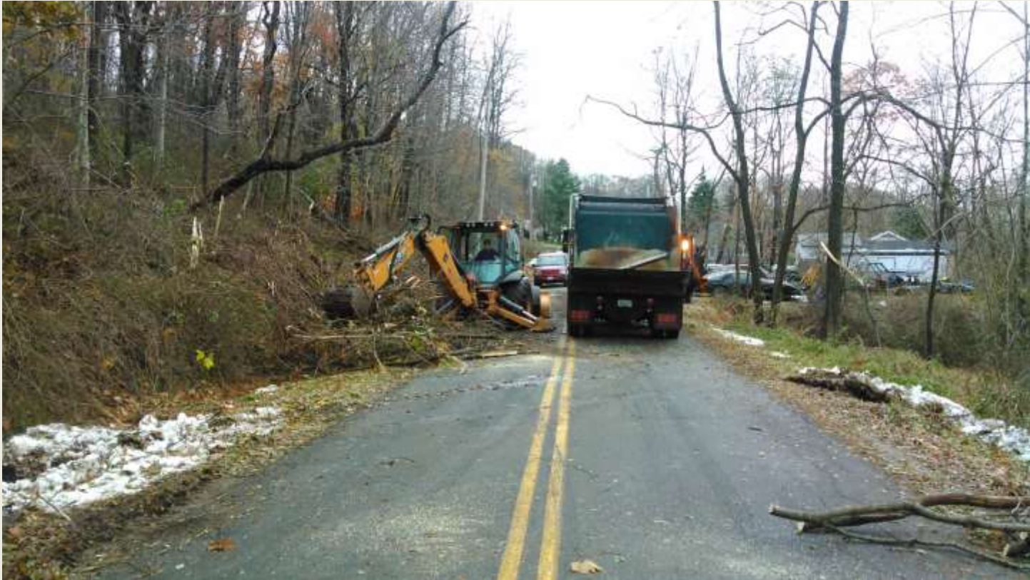
West Meadow Road cleanup. Snow & Ice storm November 2014