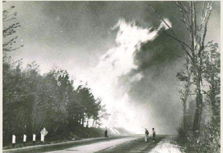
Wildfire, 1947 Route 1 in Arundel