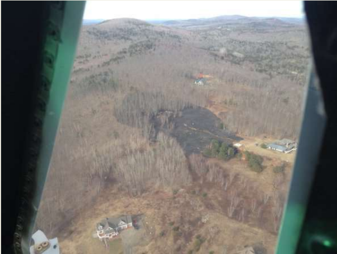
Hope wildland fire, 2016