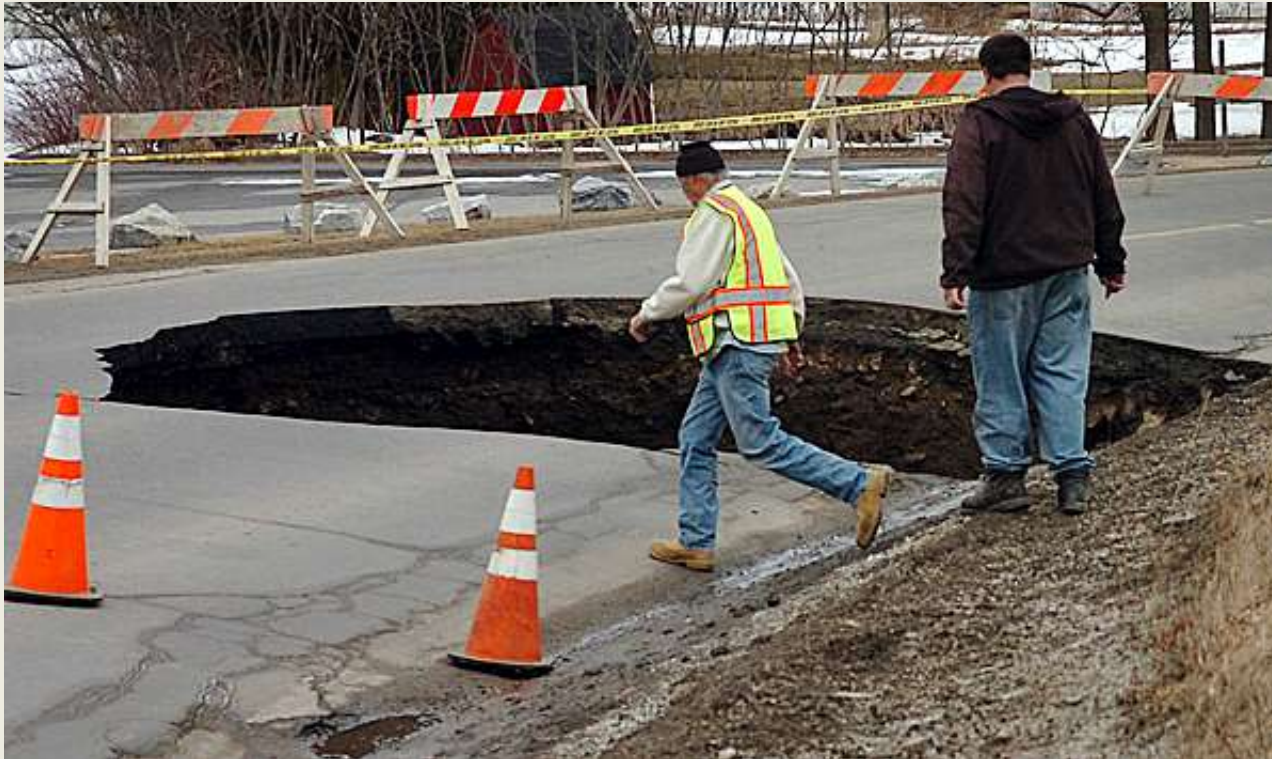
The Rockland Sinkhole of 2010