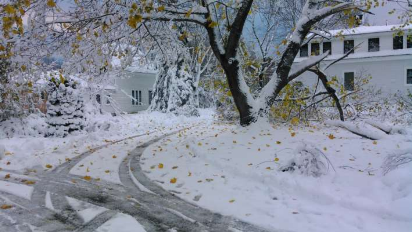
Debris in Hope Snow & Ice storm November 2014