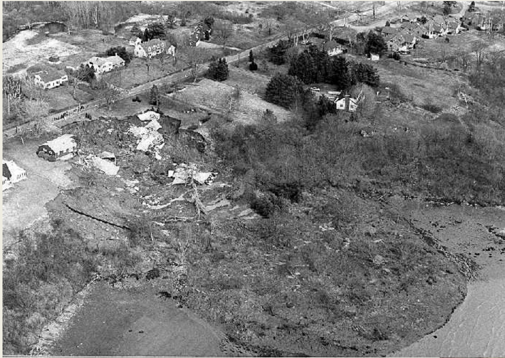
Rockland Landslide, 1996