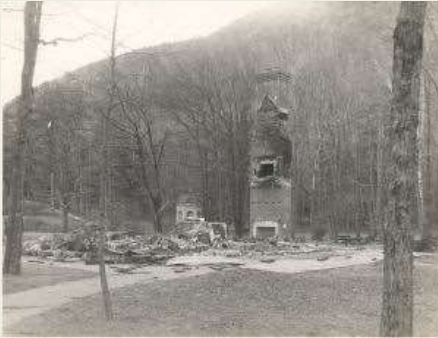
Wildfire, 1947 Acadia National Park